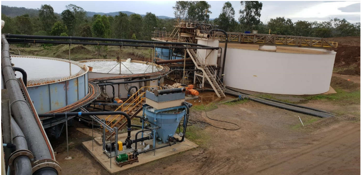
Photo 5. Thickeners removing the slimes