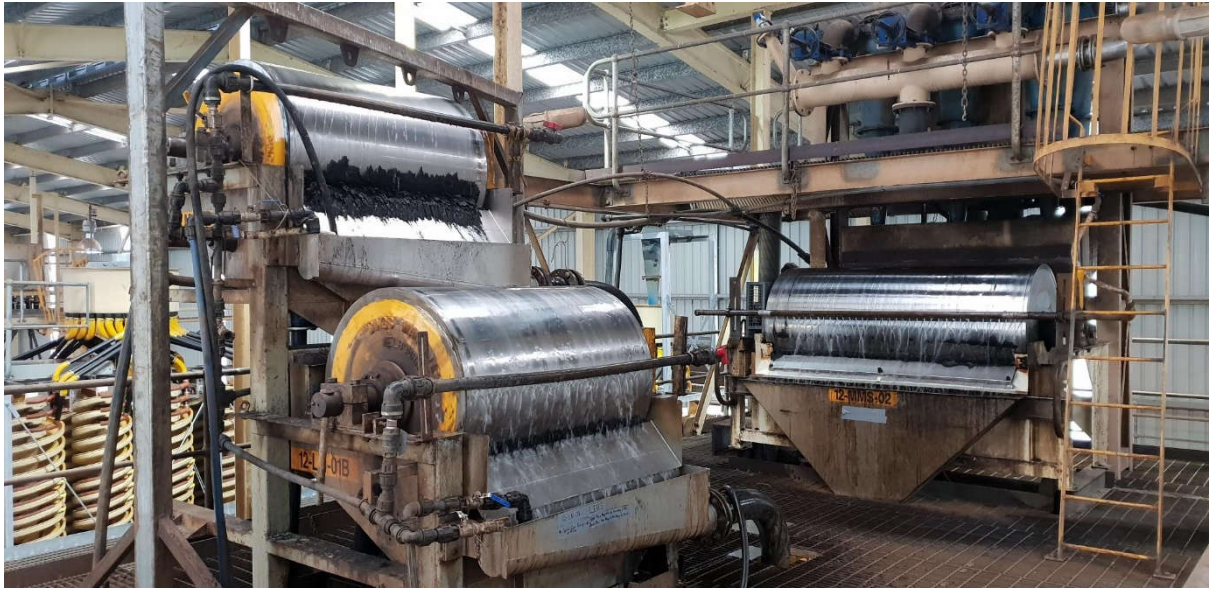
Photo 4. LIMS removing the titano-magnetite