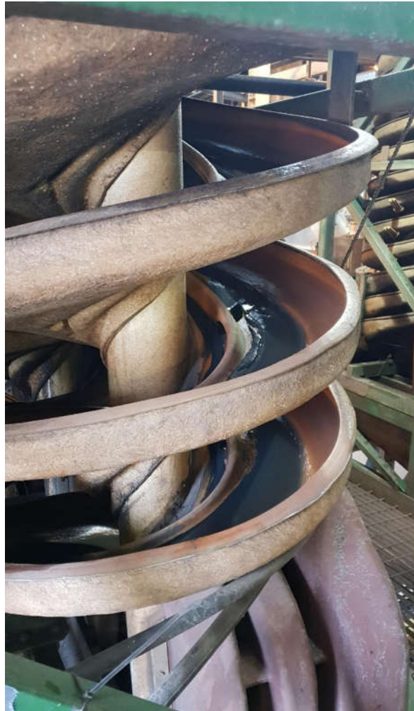
Photo 6. Spirals recovering the valuable HMS