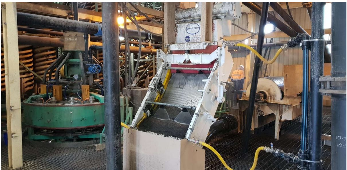
Photo 3. New sieve bend in action