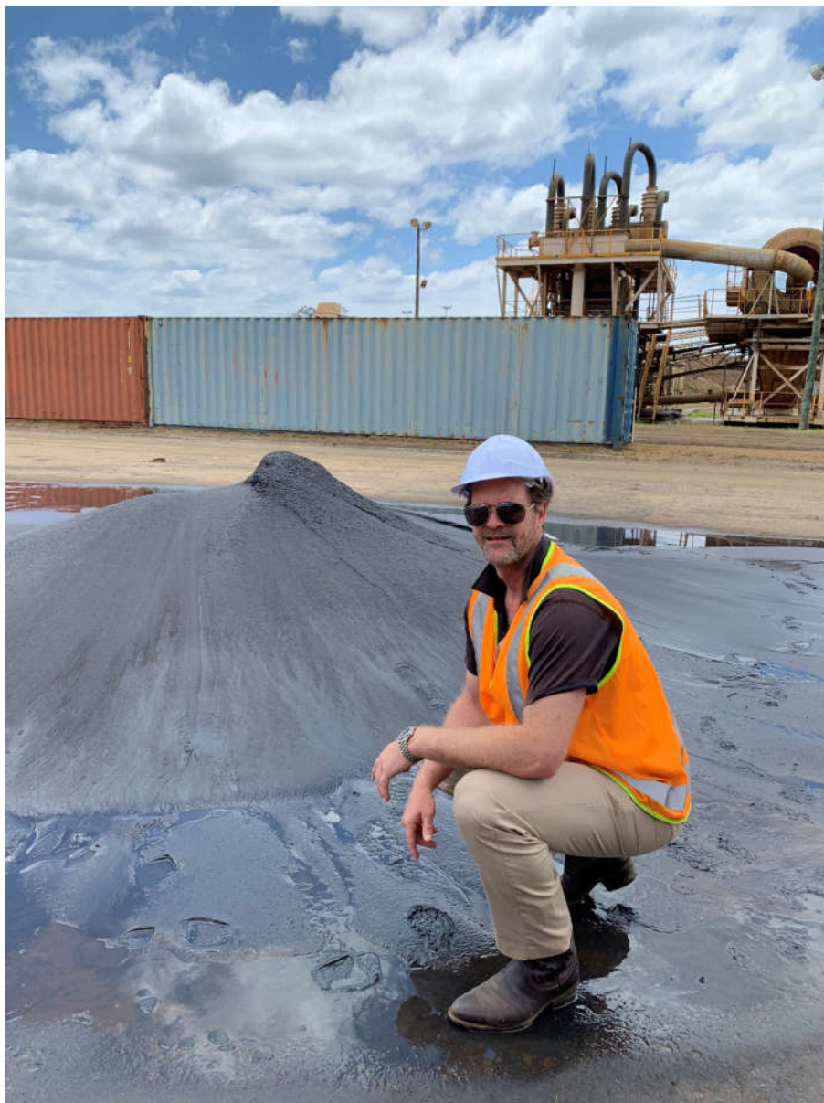
Photo 1. First ilmenite production